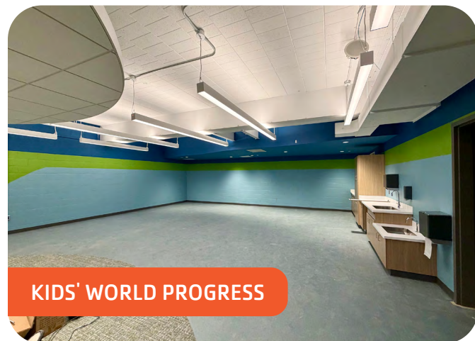
KIDS' WORLD PROGRESS