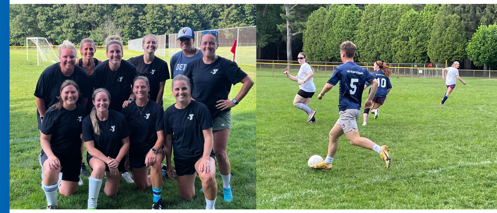
SPRING: APRIL 22-MAY 26 | SUMMER 1: JUNE 3-JULY 14* | SUMMER 2: JULY 15-AUG 18 *NO GAMES JULY 4

*Contact Jentry Karpin at jentry.karpin@tcfymca.org to receive discount.