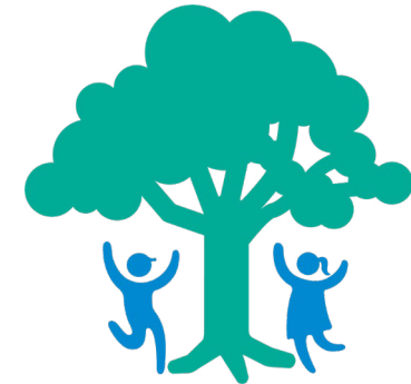
LEARNING TREE PRESCHOOL